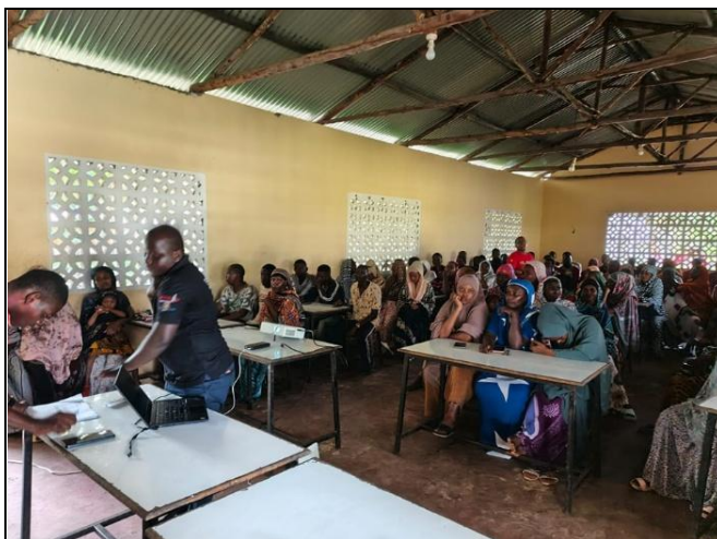
Figure 2 Women from the Aweer community in Barigoni receiving digital literacy training, gaining skills to access online work and economic opportunities.

The initiative also reached the Aweer community in Barigoni village, a marginalized group that had previously been cut off from economic opportunities. Through targeted outreach, over 20 youths, including young women, are diversifying their income sources, reducing reliance on scarce local jobs, and inspiring their peers. The program is building confidence, economic resilience, and ensuring marginalized communities are part of Kenya's digital transformation.