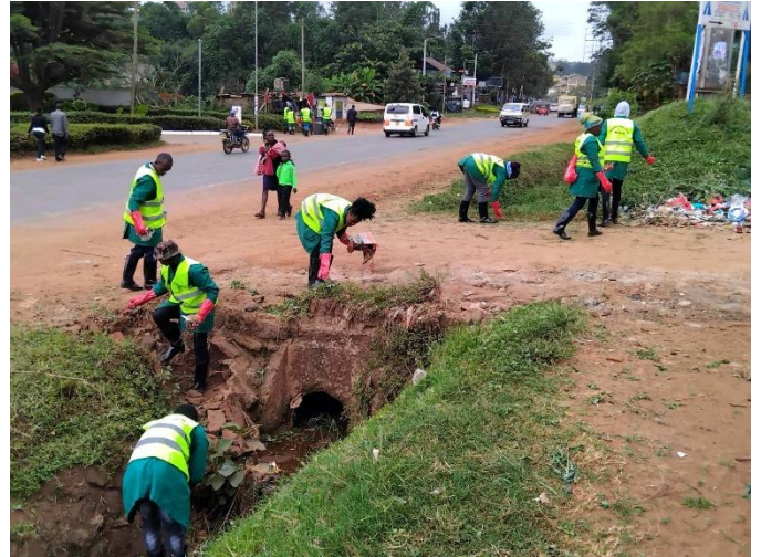
Youths engaged in town cleaning, drainage clearing, and environmental conservation.