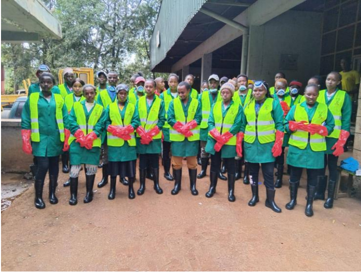
Youths ready to engage in various community service activities