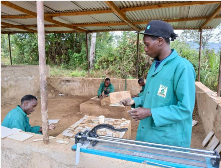
A group of youths demonstrating their masonry skills acquired during the vocational training period.

Upon successful completion of the vocational training, graduates receive seed capital of KES. 15,000 to kick-start their businesses based on their acquired skills.