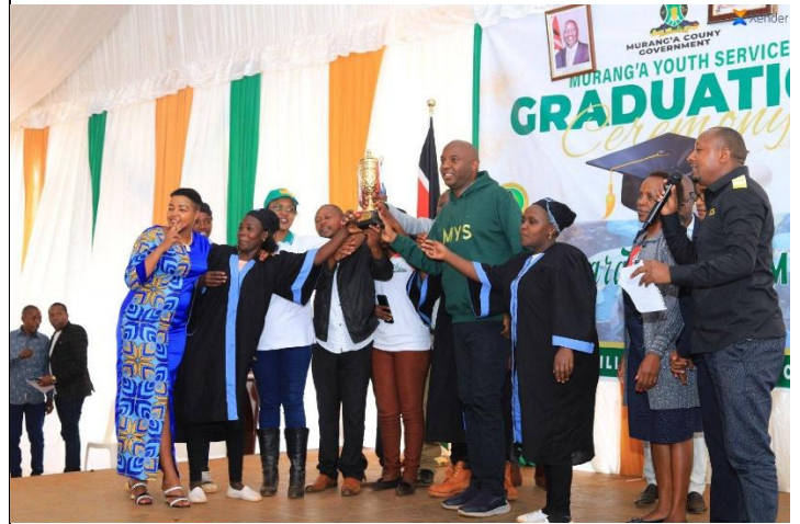
Youths at the Murang'a youth graduation ceremony