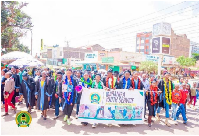
A group of youths celebrating graduation after completing their Technical Vocational Education and Training