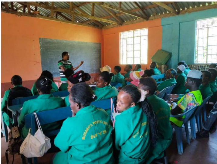
Youths undergoing vocational training