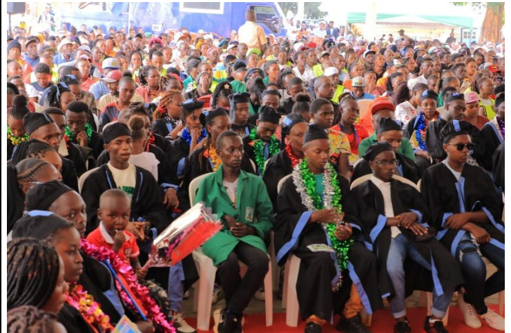
Youths at the Murang'a youth graduation ceremony