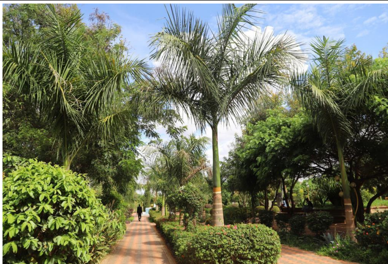
A photo of the Wote Green Public Park