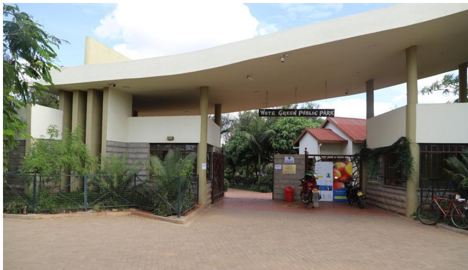
A photo of the Wote Green Public Park