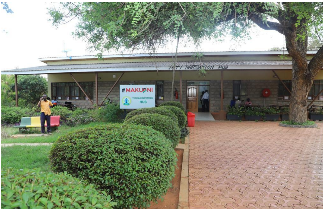
A photo of the Makueni ICT and Innovation Hub

To address this digital divide, the County Government has established the Makueni Technology and Innovation Hub within Wote Green Public Park. This hub offers a range of services, including free Wi-Fi coverage throughout the park, free computer classes, and hosts various innovation challenges to inspire young individuals to become innovators.