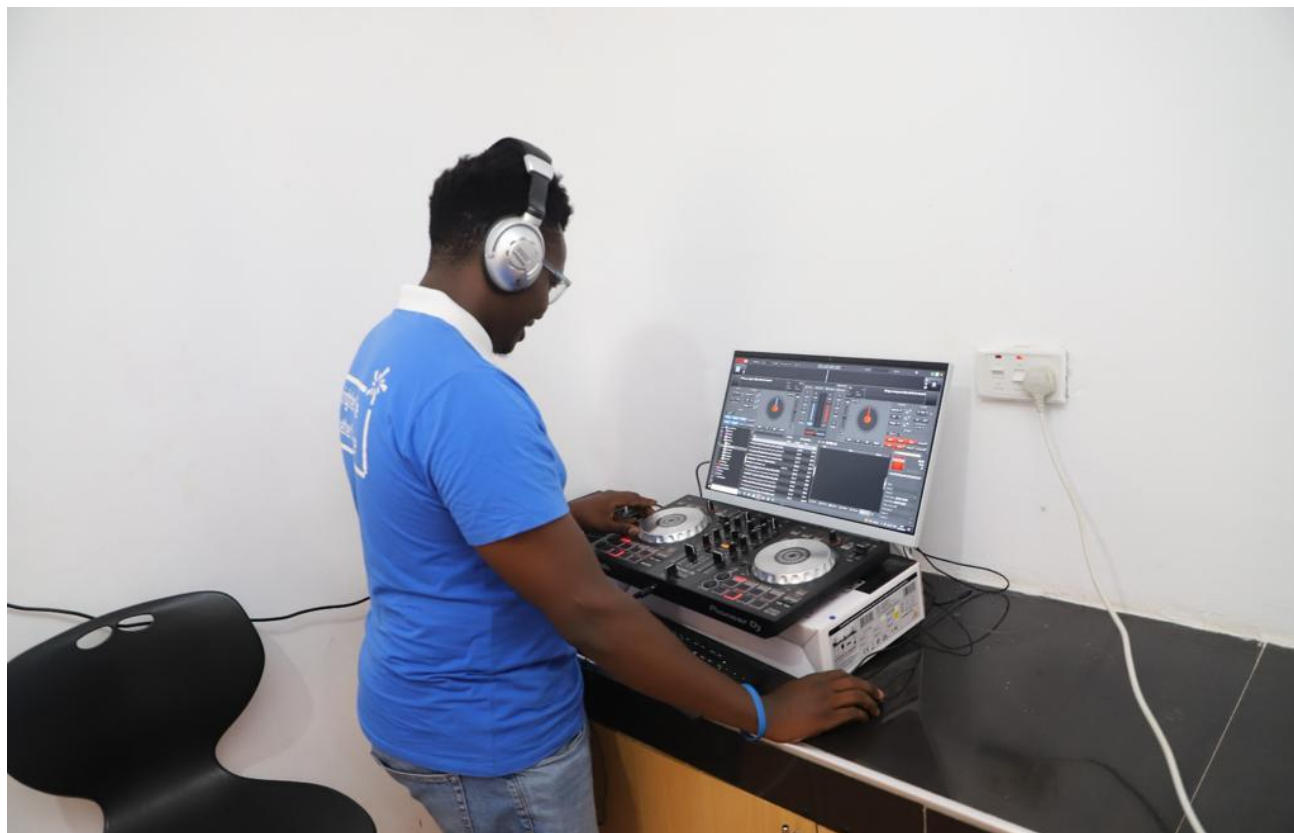
A student during a DJ class session