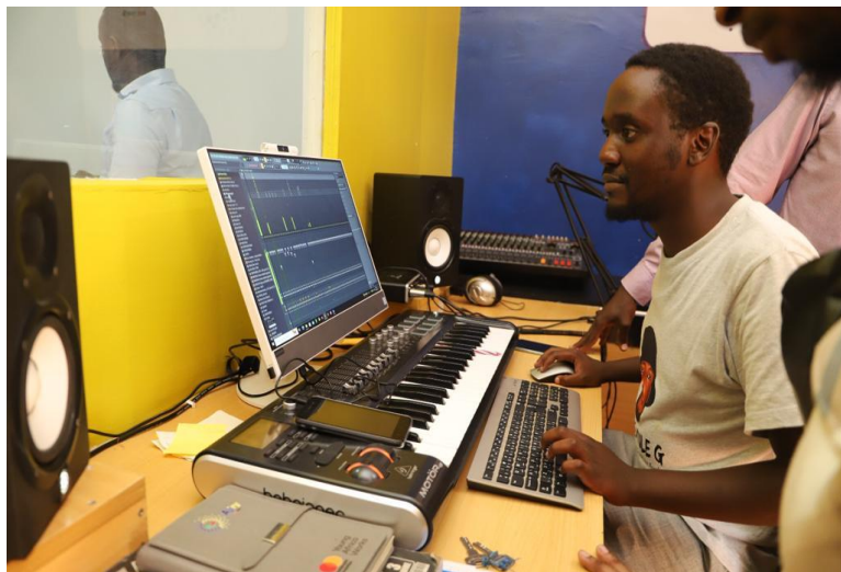
Students recording music at the Ajiry Centre