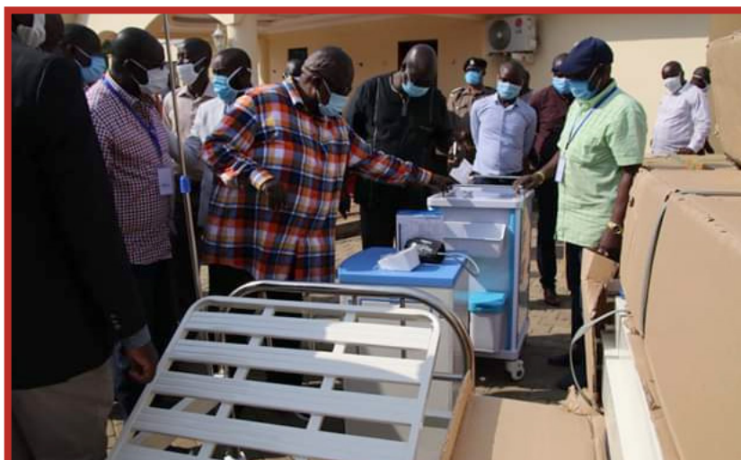
Governor Awiti receiving equipment for the isolation facilities from the suppliers