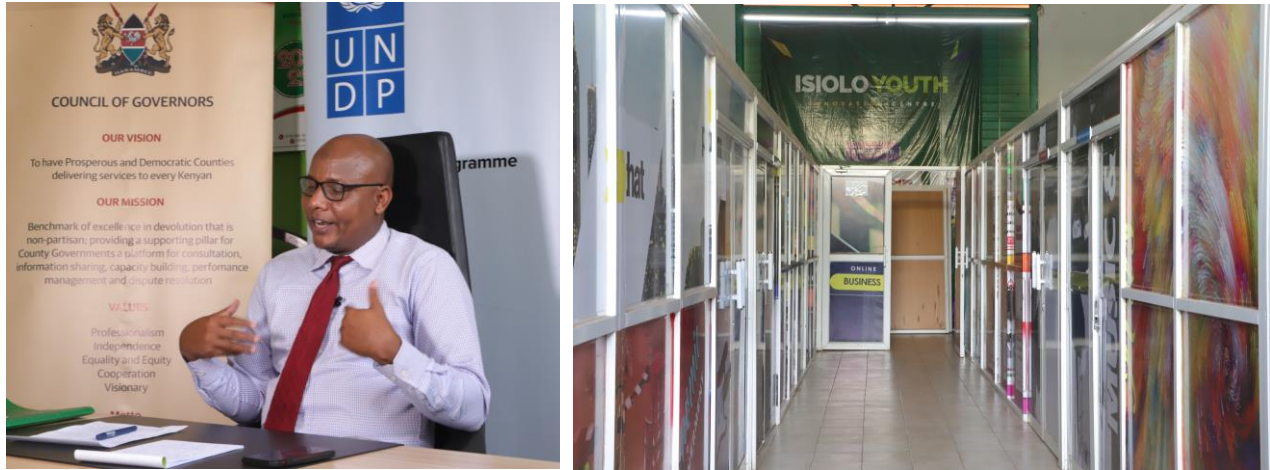
Pic 1: CECM in charge of Youth, Isiolo County